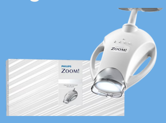
Zoom In-office Whitening $950 nett