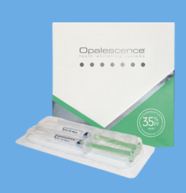
Home Whitening $450 nett