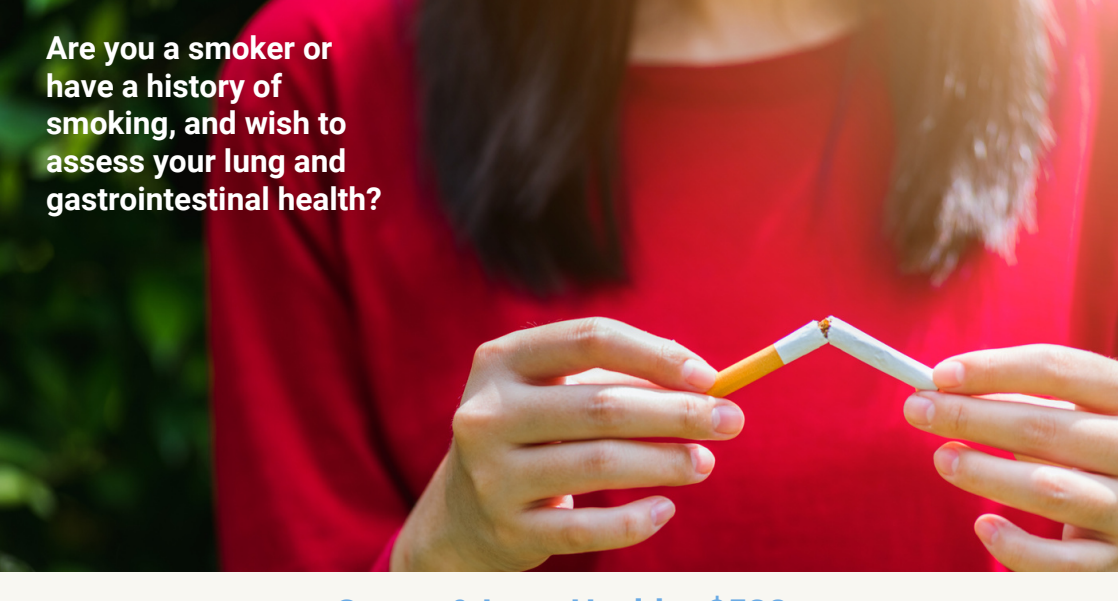
Gastro & Lung Health - $538 (Recommended for Drinkers and Smokers)

Doctor's Consultation Medical Examination Clinical Measurement Body Fat Analysis